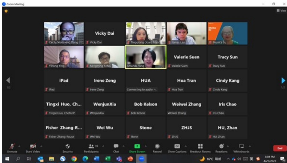
Participants of the roundtable